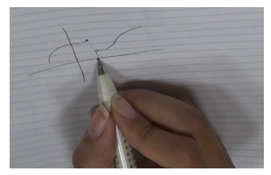
Figure 1. Sandra's example for discontinuity

Similarly, Daniel was confused about limit and continuity. But Sandra wrote an example, drawing a graph from memory, explaining the relationship between continuity and limit. When Daniel said "How does this happen, when it has a limit but is not continuous?", Sandra drew a graph of the function (with jump discontinuity given in Figure 1) to explain.